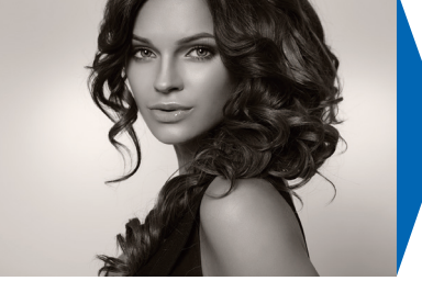
Without Gray or Light Gray (Reddish)

Create real monochrome images without color shifts and easily produce smooth gradation, light shadows and metallic texture. Large capacity ink bags (1,5 liter/1,500 ml) and subtank system allow non-stop printing.