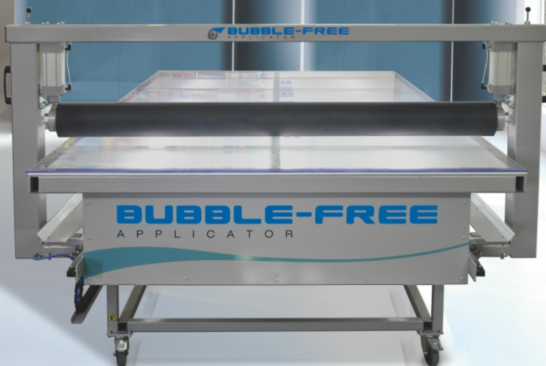
Table height electrically adjustable