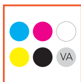
CMYK, Clear & White