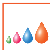
Piezo Variable Drop