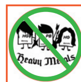
Free of Heavy Metals