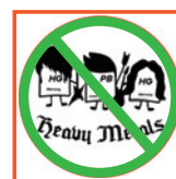
Free of Heavy Metals