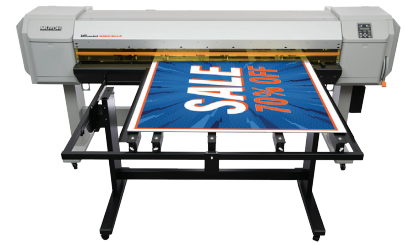
ValueJet 1638UR Mark II