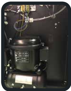
Silent compressor inside the machine