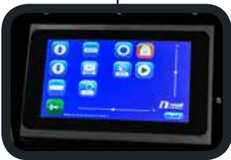
LCD Touch Screen Display