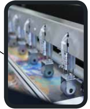
Pneumatic Pinch Roll