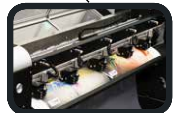
Double central cutting units (optional)