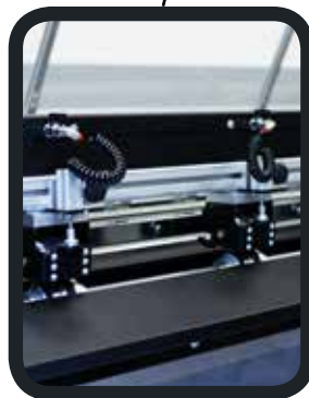
Pneumatic vertical cutting units