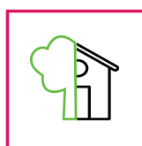
Outdoor / Indoor