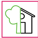
Indoor / Outdoor